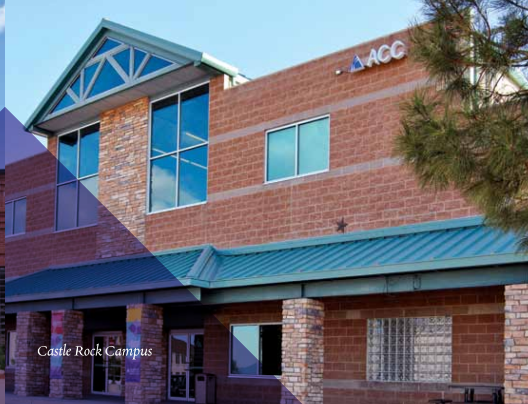
Castle Rock Campus