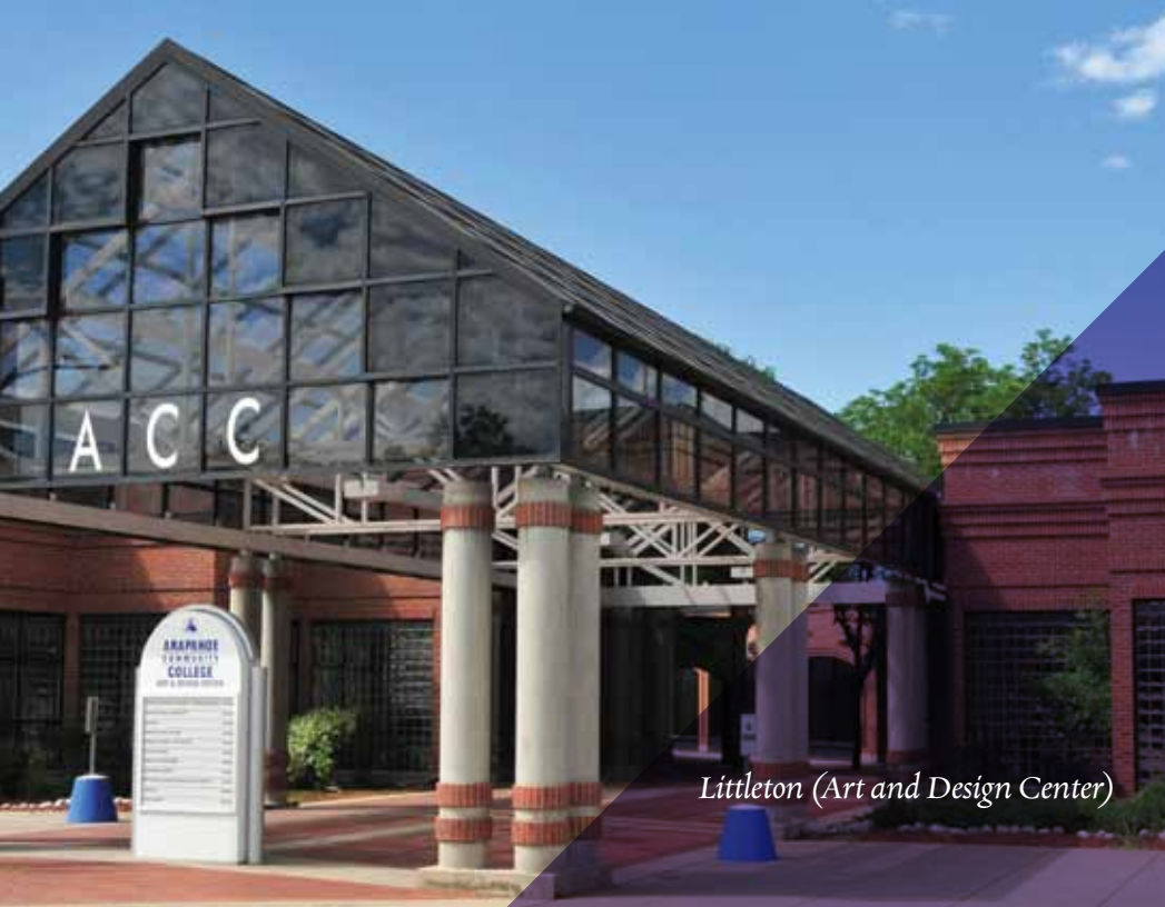
Littleton (Art and Design Center)